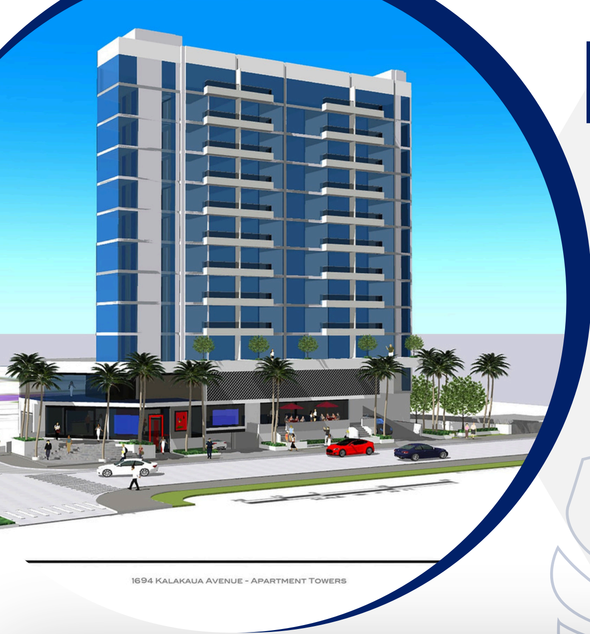
1694 KALAKAUA AVENUE - APARTMENT TOWERS

Bring together your contractors and vision to transform this site located on a major thoroughfare. Don't miss this unique opportunity to capitalize on this strategic location for your upcoming commercial and residential projects.